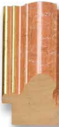
J-306 (1 1/2")