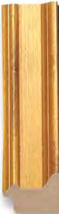
SC-231 (1 3 / 8 ")