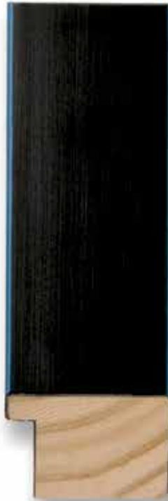
K-743 (1 1/2")