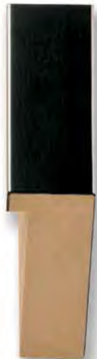
K-742 (1 1/8")