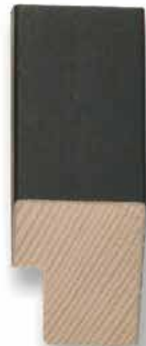
947/31 (1 1/8")