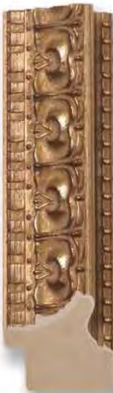
TS-642 (1 3/8")