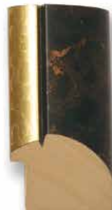
A-853 (1 1/2")