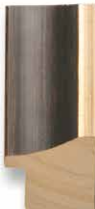
RG-642 (1 3/8")