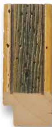
TA-520 (1 1/8")