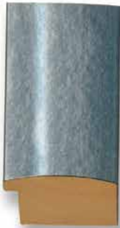
A-945 (1 1/2")