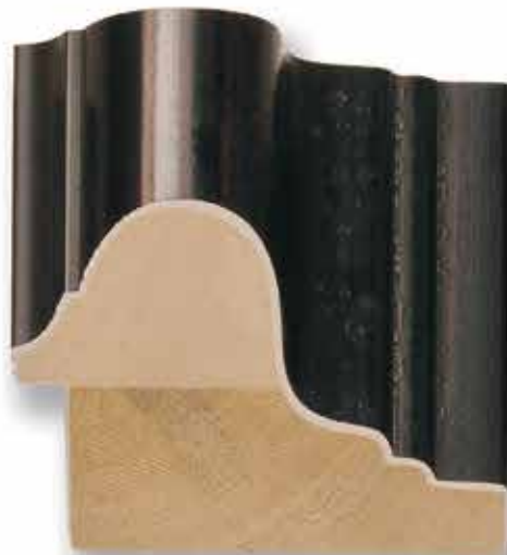
SC-229 (3 1 / 8 " )