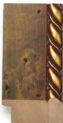
TA-522 (1 5/8")