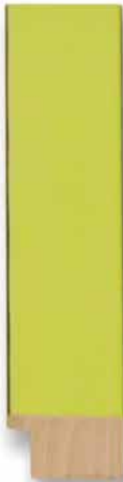
TA-495 (1 1/8")