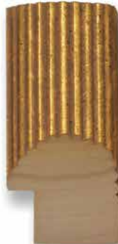
L-560 (1 1/2")