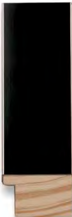
K-748 (1 1/2")