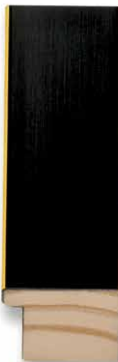
K-746 (1 1/2")