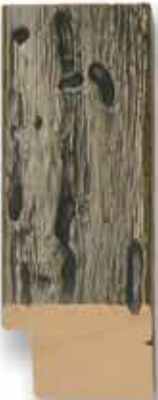
MA-101 (1 1/8")