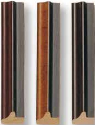
K-713 (3/8") K-714 (3/8") K-715 (3/8")