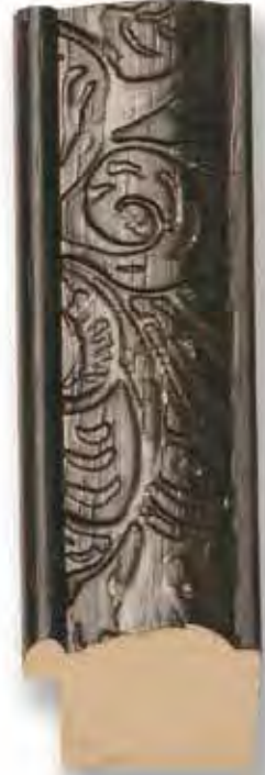
TA-448 (1 1/2")