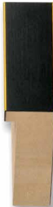
K-740 (1 1/8")