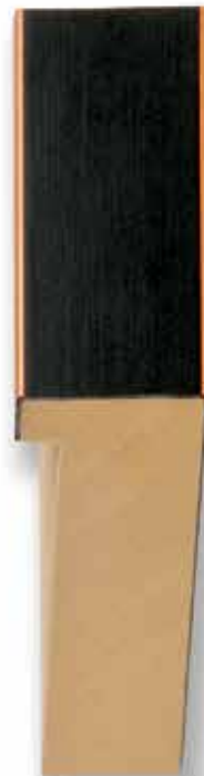
K-739 (1 1/8")