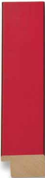
TA-496 (1 1/8")