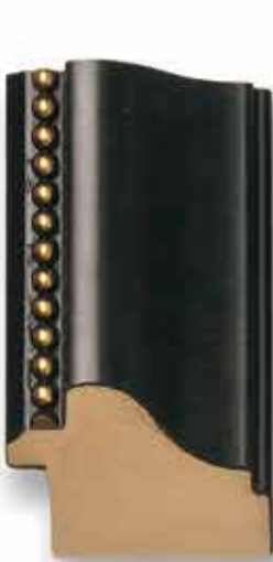
K-702 (1 5 / 8 " )