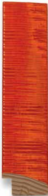
TA-442 (1 1/8")