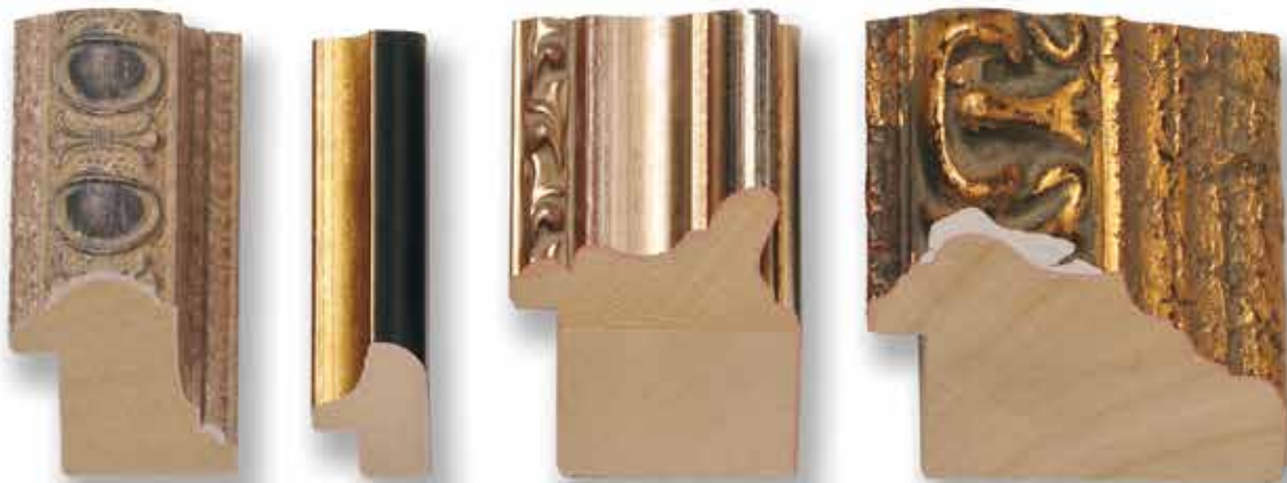
TS-622 (1 1/2") SC-212 (3/4") SC-206 (2") TS-629 (3")