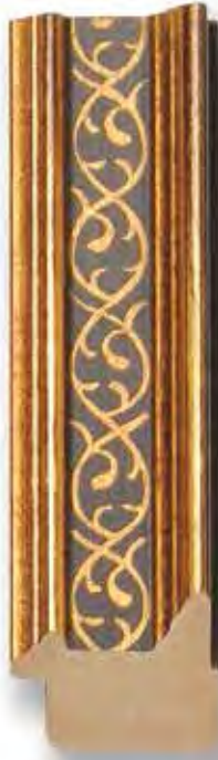
SC-230 (1 3 / 8 ")