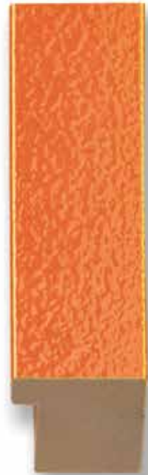
K-751 (1 1/4")