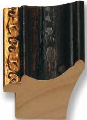
515/37 (2 1/4")