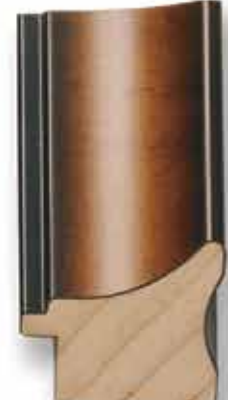
K-708 (1 3/8")