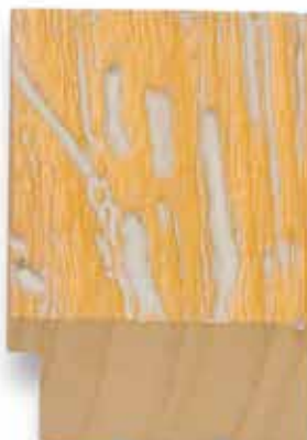
MA-204 (2 1/8")