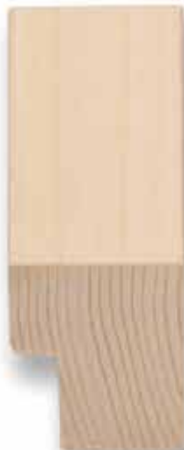
947/10 (1 1/8")