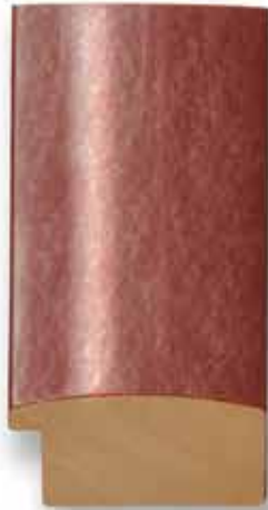
A-943 (1 1/2")