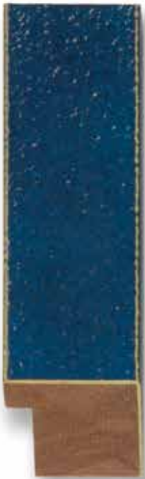
K-749 (1 1/4")