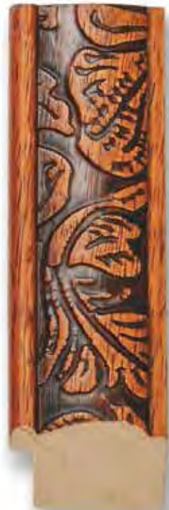
TA-450 (1 1/2")