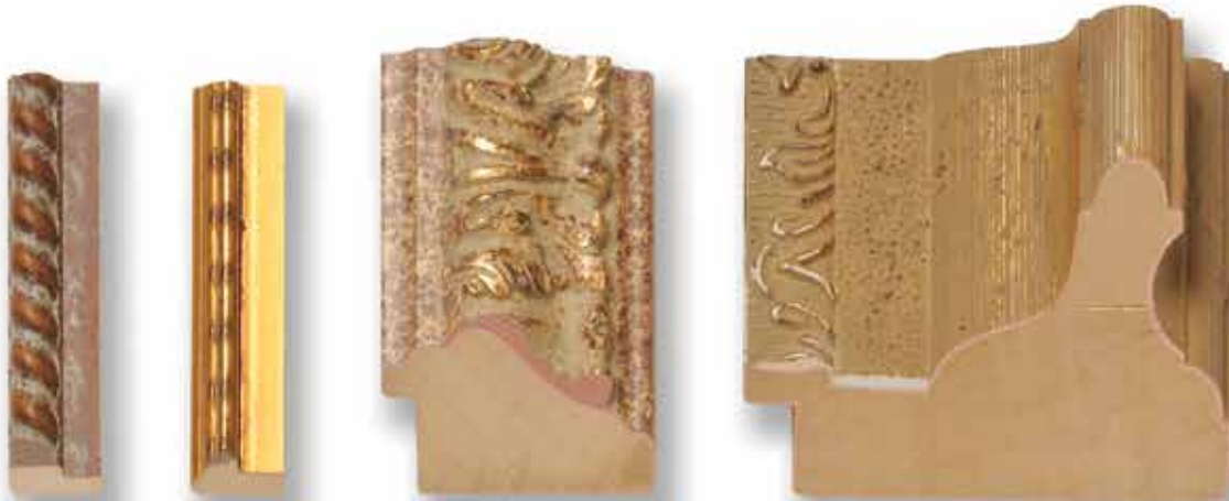
C-4954 (3/8") L-590 (3/8") TS-602 (1 7/8") TS-617 (3 1/2")