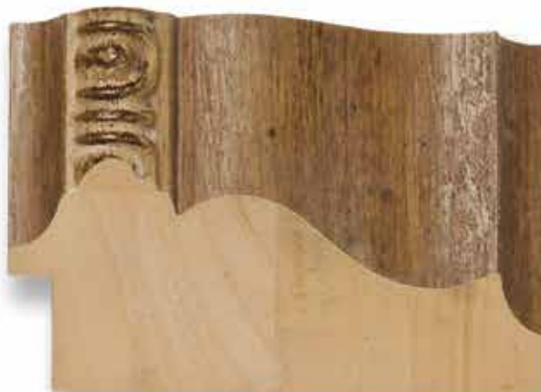
RG-633 (4 1/2")