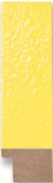
K-752 (1 1/4")