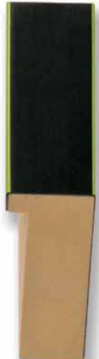
K-738 (1 1/8")