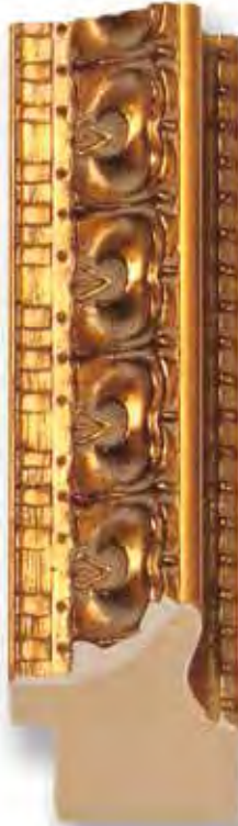
TS-641 (1 3/8")