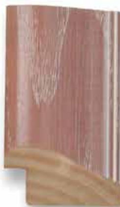
T-559 (1 3/4")