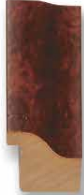
K-732 (1 1/4")