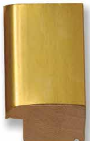
G-401 (1 3/4")