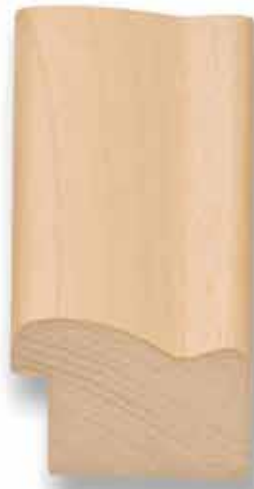
TA-466 (1 1/2")