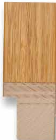
947/13 (1 1/8")