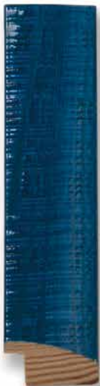
TA-441 (1 1/8")