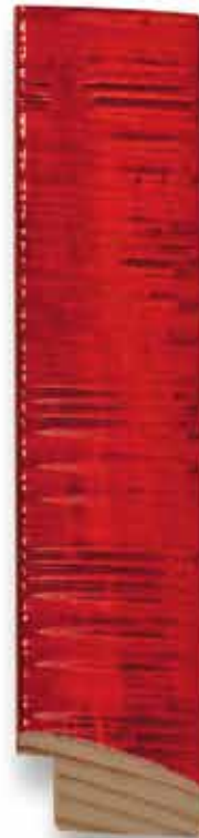
TA-444 (1 1/8")