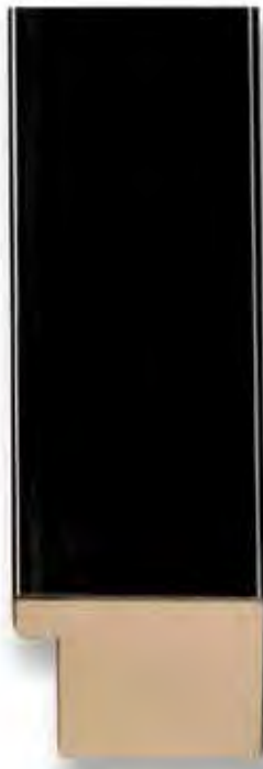
K-755 (1 1/2")