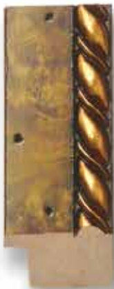
TA-515 (1 1/8")