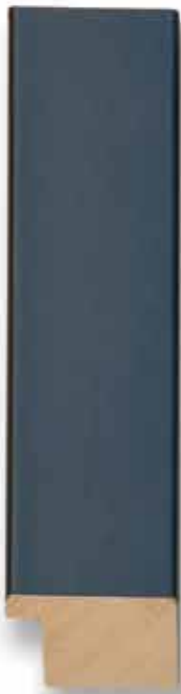
TA-493 (1 1/8")