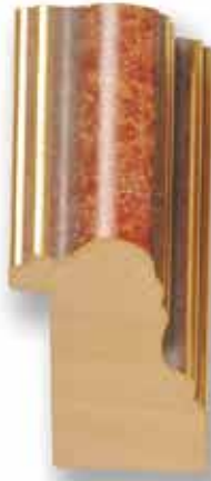
A-953 (1 3/8")