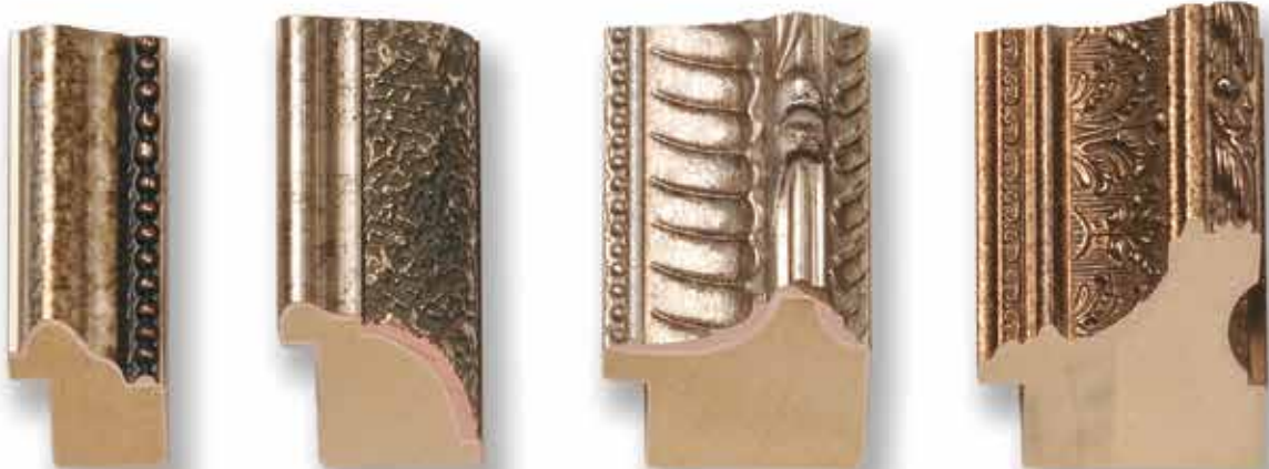
SC-202 (1") A-889-S (1 1/4") TS-618 (1 3/4") SC-248 (2")