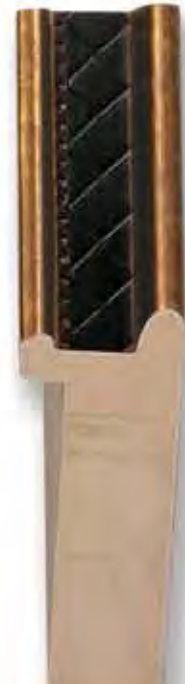
SC-238 (1 1/4")