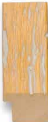
MA-104 (1 1/8")