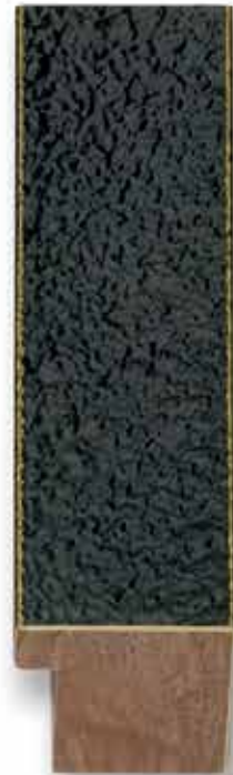
K-754 (1 1/4")