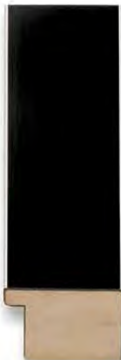
K-756 (1 1/2")