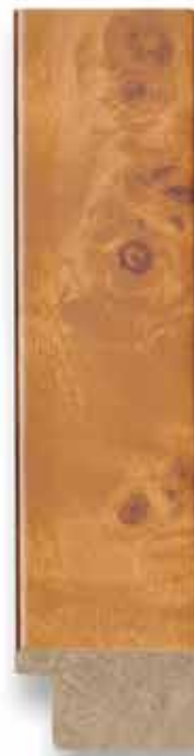
TA-501 (1 1/8")