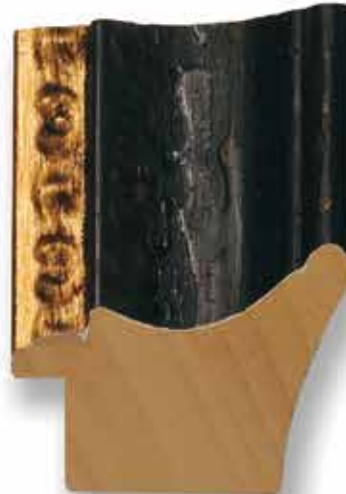
515/31 (2 1/4")