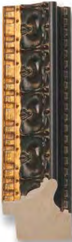
TS-643 (1 3/8")