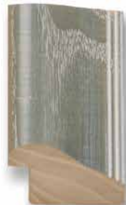
T-560 (1 3/4")