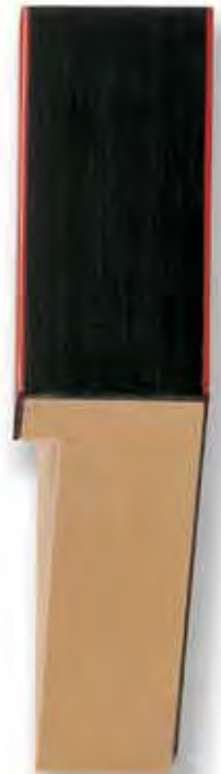
K-741 (1 1/8")