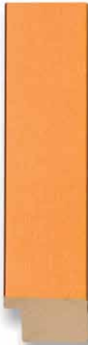
TA-494 (1 1/8")