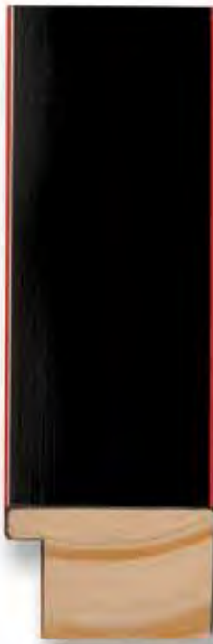
K-747 (1 1/2")