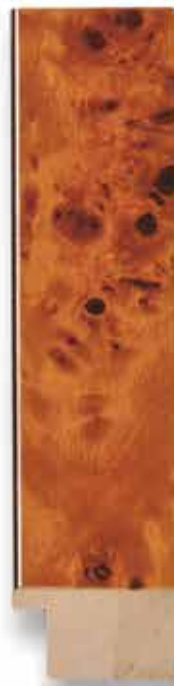
TA-502 (1 1/8")