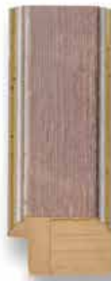
A-884 (1 1/8")