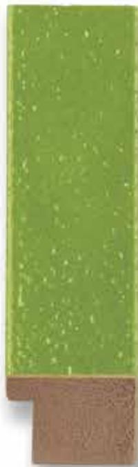
K-750 (1 1/4")