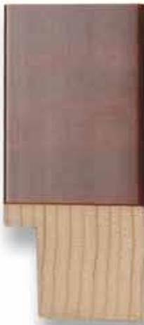
TA-479 (1 3 / 8 " )