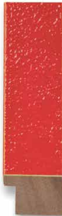
K-753 (1 1/4")