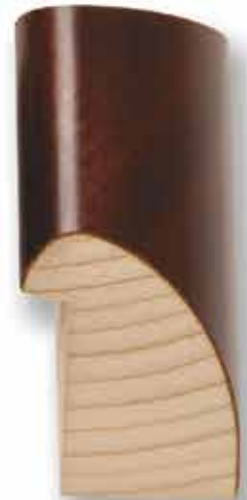
TA-463 (1 1/2")