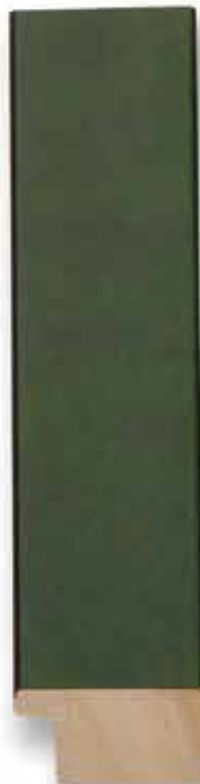
TA-497 (1 1/8")