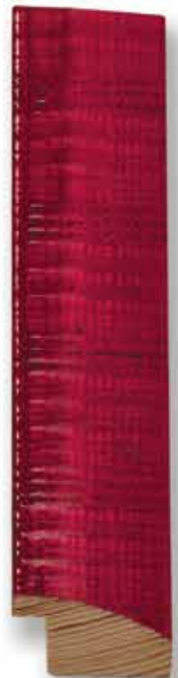
TA-445 (1 1/8")