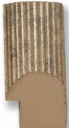
L-572 (1 1/2")