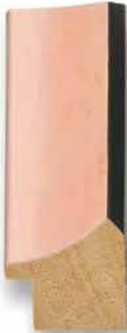
974/57 (1 1/8")