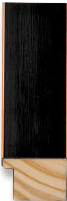
K-745 (1 1/2")