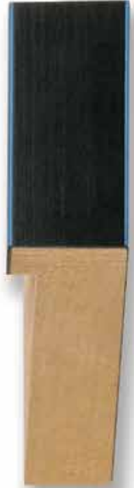
K-737 (1 1/8")