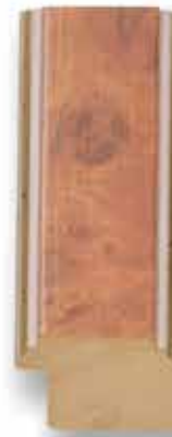
A-883 (1 1/8")