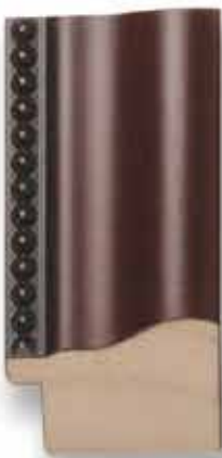
K-718 (1 1/2")