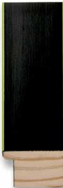
K-744 (1 1/2")