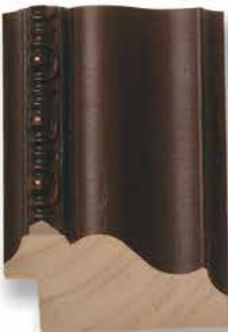
RG-624 (2 1 / 8 " )