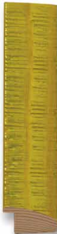
TA-443 (1 1/8")