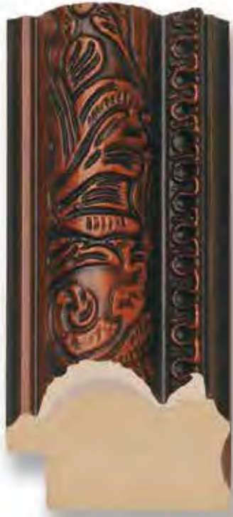
TA-535 (2 1/8")