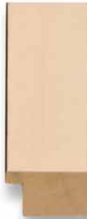
TA-492 (1 1 / 8 " )