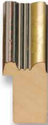
A-859 (1 1/8")