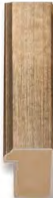
SC-241 (1 1/8")