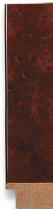
TA-504 (1 1/8")