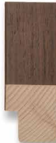
947/17 (1 1/8")