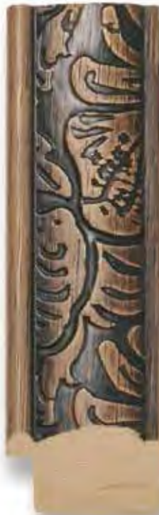
TA-449 (1 1/2")