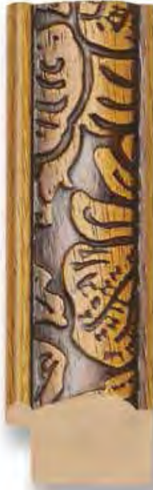
TA-447 (1 1/2")