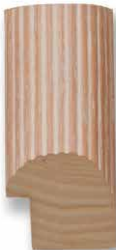
J-285 (1 3/8")