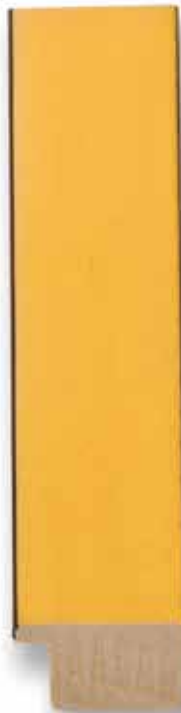
TA-498 (1 1/8")