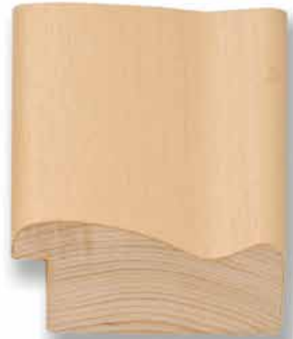
TA-469 (2 1/2")