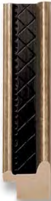
SC-235 (1 1/4")