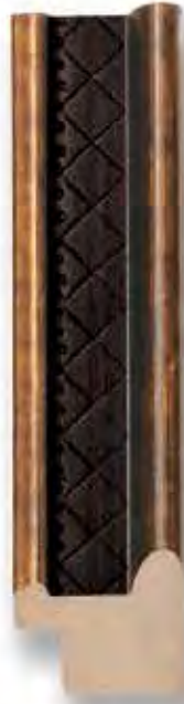
SC-234 (1 1/4")