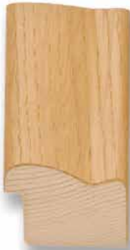
TA-467 (1 1/2")