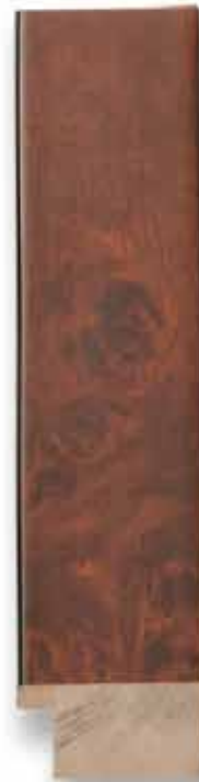
TA-503 (1 1/8")